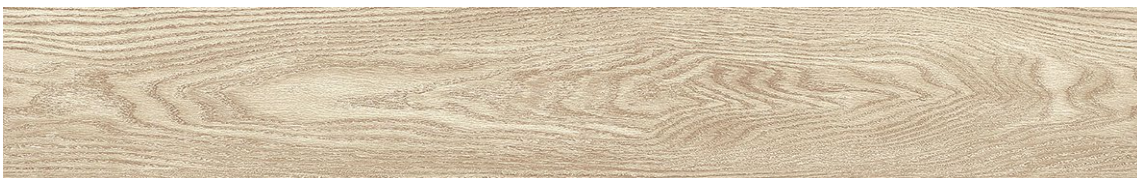
844 - PECAN SPICE