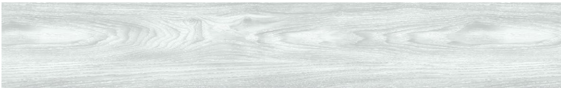
845 - BLEACHED ASH