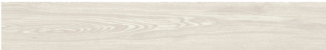
846 - MOONLIT PINE