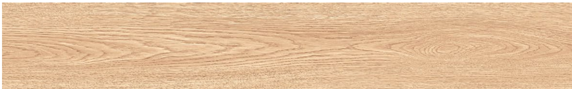
1215 - GOLDEN TEAK