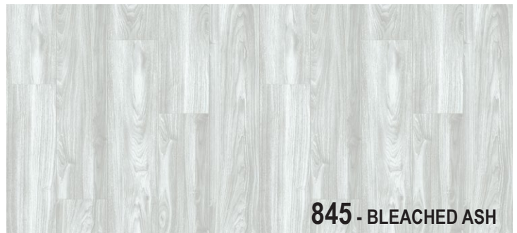
845 - BLEACHED ASH