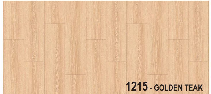
1215 - GOLDEN TEAK