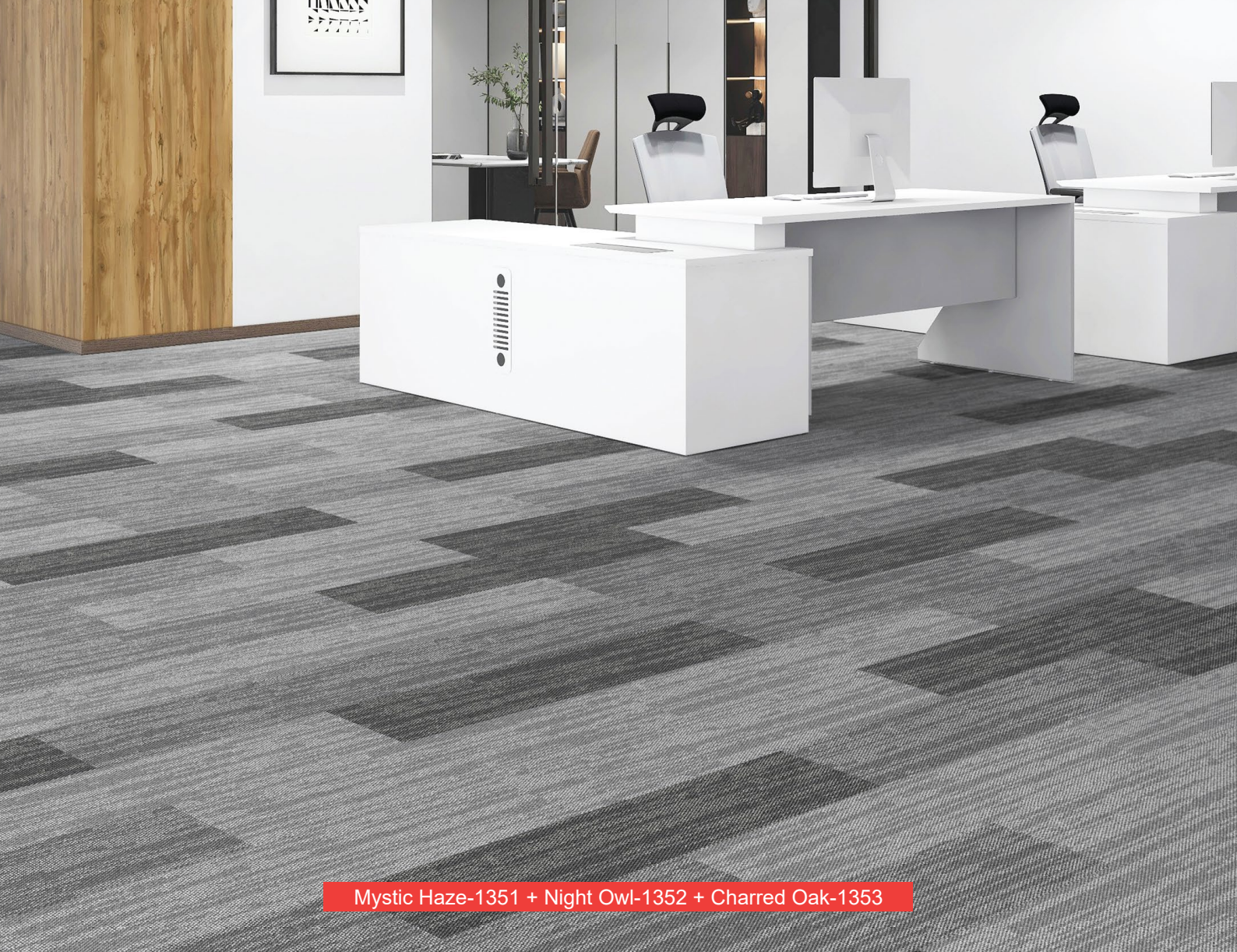
Mystic Haze-1351 + Night Owl-1352 + Charred Oak-1353