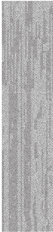
Mystic Haze 1351