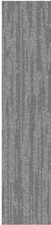
Night Owl 1352