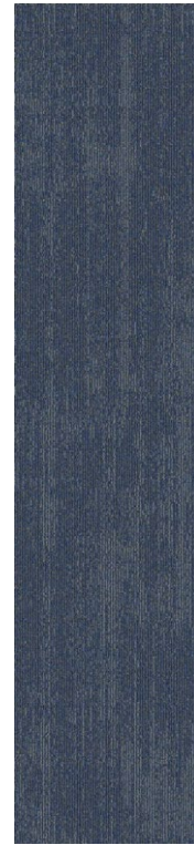
Nautical Navy 1371