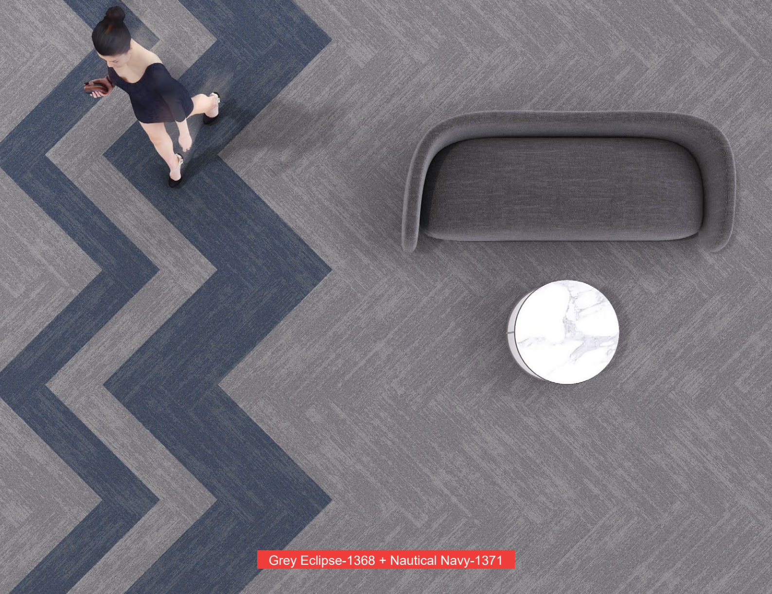
Grey Eclipse-1368 + Nautical Navy-1371