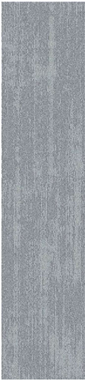
Grey Eclipse 1368