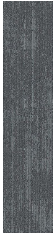
Midnight Magic 1370