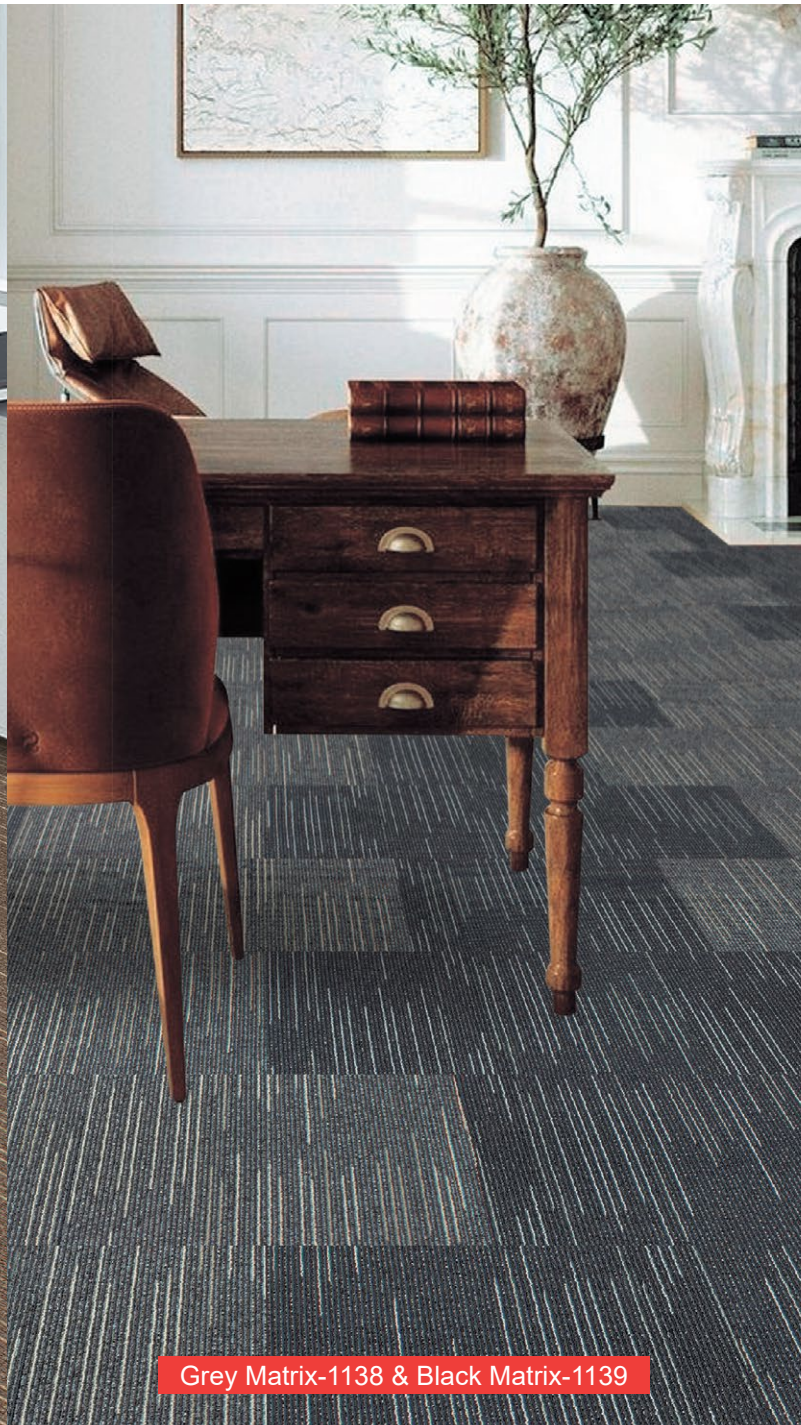
Grey Matrix-1138 & Black Matrix-1139