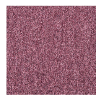
Garnet Red 1085