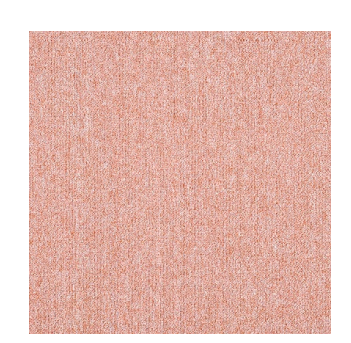
Golden Poppy 1087