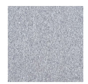
Grey Ash 1083