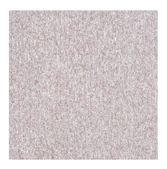
Fine Beige 1082