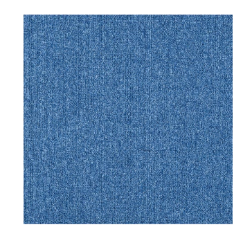
Azure Blue 1086