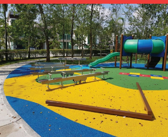
Beautiful Seamless Playground Design Can be done using different colour combination.